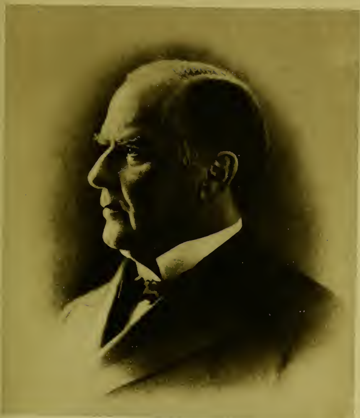
Portrait of the artist G. Z. 1870